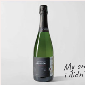
NV A. Bergere Origine Brut, France